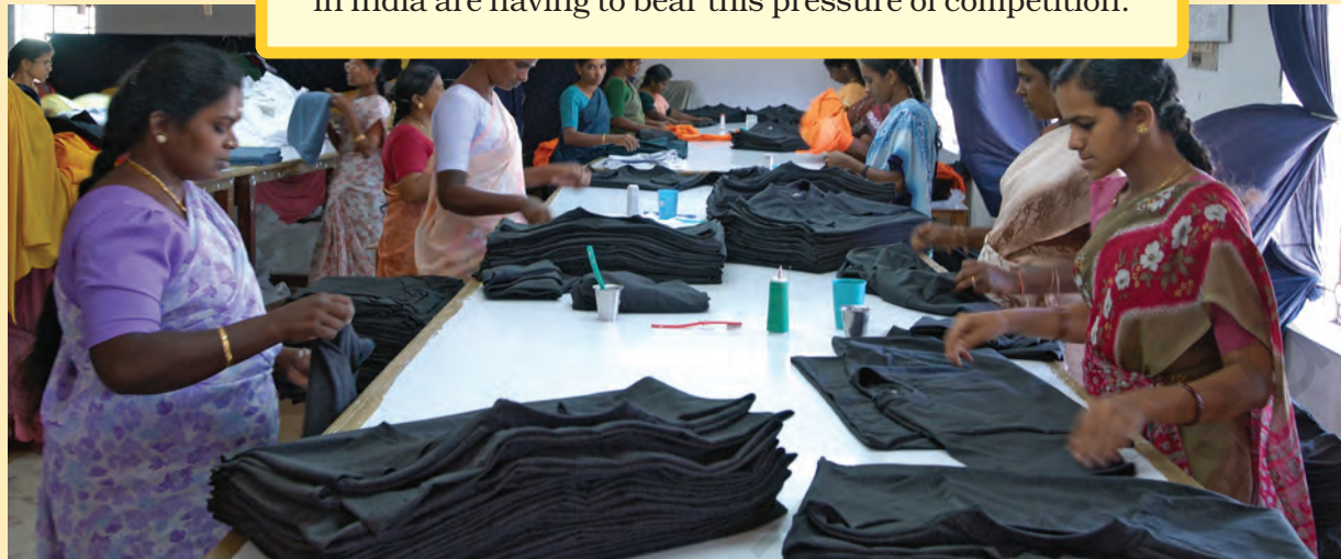
Factory workers folding garments for export. Though globalisation has created opportunities for paid work for women, the condition of employment shows that women are denied their fair share of benefits.

Let us see how the workers in the garment export industry in India are having to bear this pressure of competition.