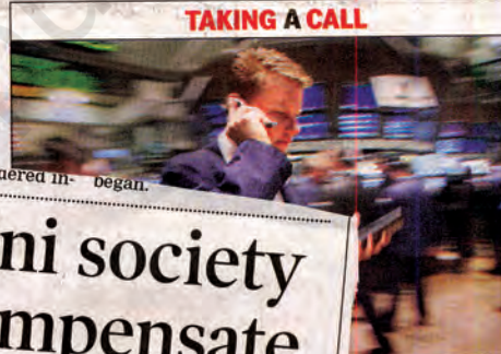
TAKING A CALL

Now those tele-service providers on the unnerving SMS will land in jail to check the menace.